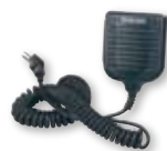
G894 - SMK05/25 Waterproof speaker mike