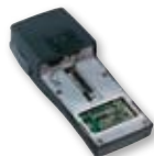
RS35 Special fitting to plug scrambler modules. HP35 is compatible with TRANSCRYPT models. Pls refer to Price list for details.