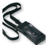
G973 - CC35 leather carry case with adjustable shoulder strap (for keypad version)